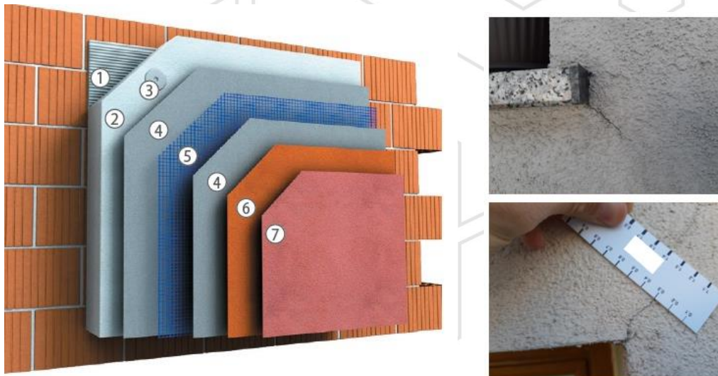
Figure: left - 1 Primer, 2 Thermal insulation, 3 Anchor, 4 Base coat, 5 Reinforcement mesh, 6 Primer, 7 Top coat; right - crack examples

External thermal insulation composite facade system (ETICS) is assembled from different materials and each has its own specific function.